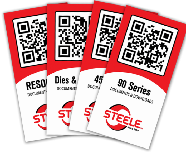
Steele QR codes connect machine operators to Technical Service Bulletins, for fast answers on installation, operations, safety and maintenance.

Your questions, concerns and comments drive the development of TSBs, so we're always open to suggestions for new bulletins. To tell us what you want to see, email us at tsbrequest@jcsteele.com .