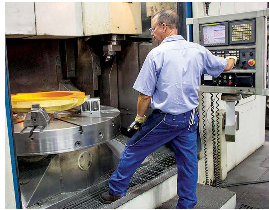
Since their in-house 3D printer is so easily accessible it's become a simple matter for JC Steele to create custom replacement, or additional, guards and other preventative solutions for the wealth of heavy equipment in all their production facilities and ensure their workers are protected.

As advanced as JC Steele's facilities are, they found the high time and fiscal costs associated with the traditional pattern making process restricted the company's ability to invest in research and development. For a company that knows first-hand the importance of innovation and growth, that was a