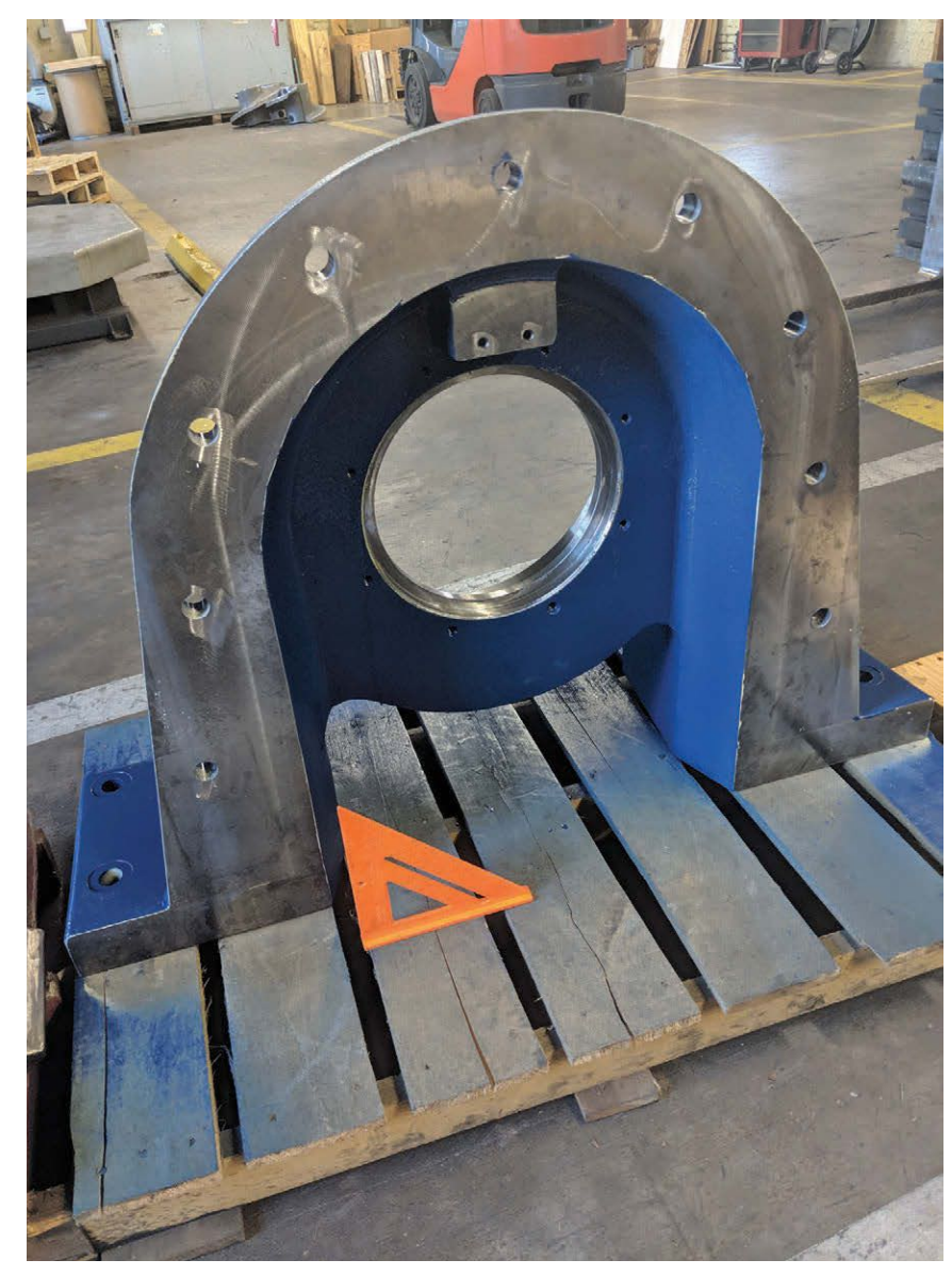
A completed casting.

"If we need a large quantity of a smaller part, I can nest 100 parts on the BigRep ONE that I can only fit a few of on another printer."