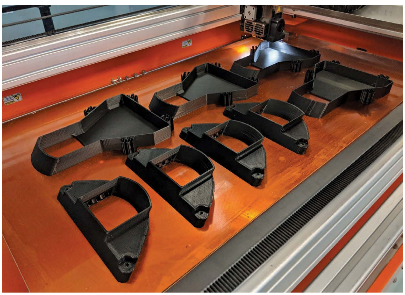
These are some of the end-use parts.