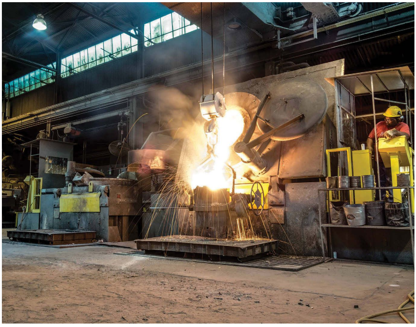
J.C. Steele & Sons, Inc., a global leader in the design and manufacturing of stiff extrusion equipment for brick making machinery, operates from Statesville, North Carolina.

In sand casting, patterns absolutely must have perfectly fine finishes. If not, they risk ruining the sand cavity while being pulled out. Because of this, wood grain or even microscopic rigidity created by a layered extrusion process can be disastrous.