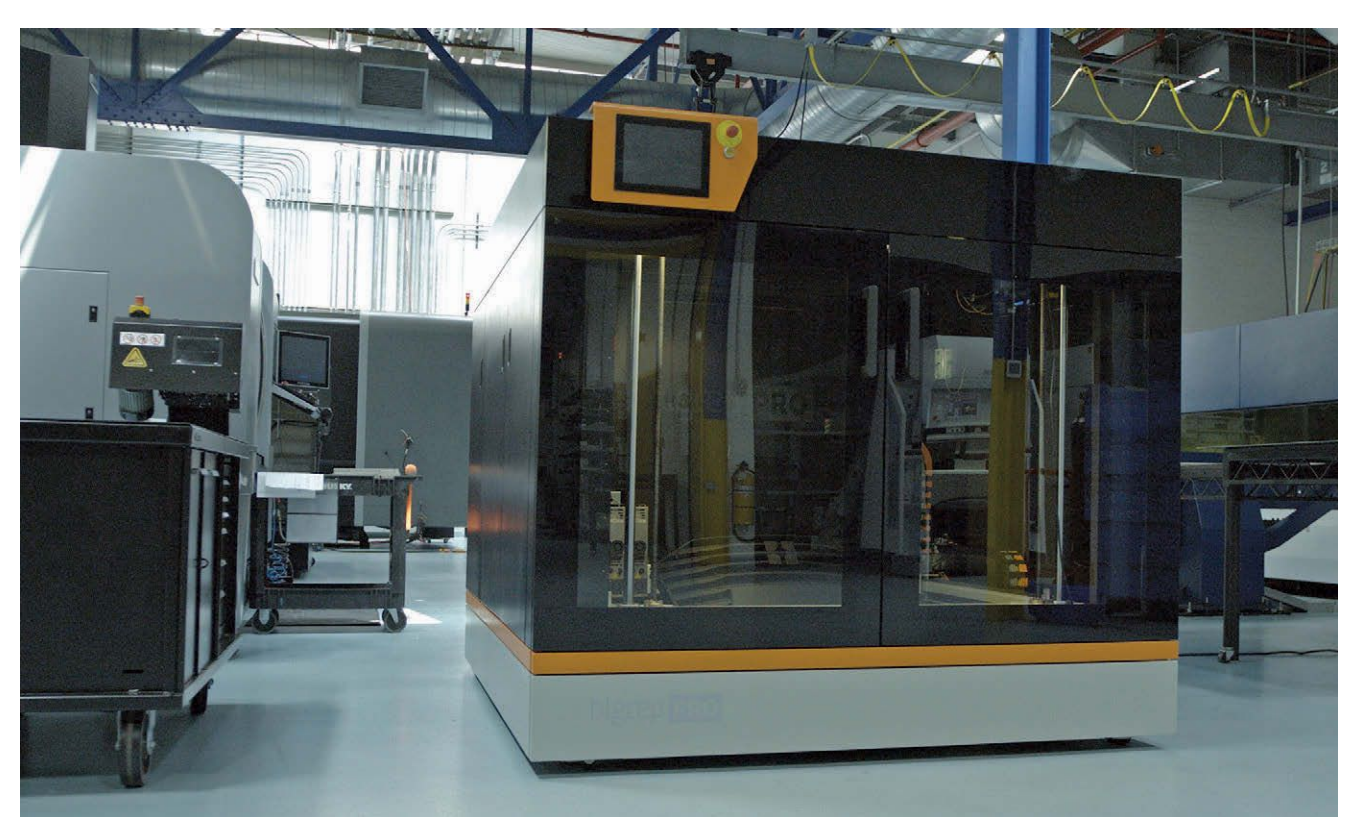
Since incorporating large-format 3D printing, Boyce Technologies has seen firsthand how 3D printing helps compress the design, engineering, and production time so they can meet tighter deadlines and get to production faster.